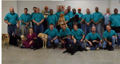
Bland Puppy Raiser Team

When the Saint Francis Service Dogs Prison Pup Program began at the medium security Bland Correctional Facility in the summer of 2002, we never expected it to become such an integral part of our program. Now all of our puppies spend time in Bland under the tutelage of our “Bland Puppy Raisers.”