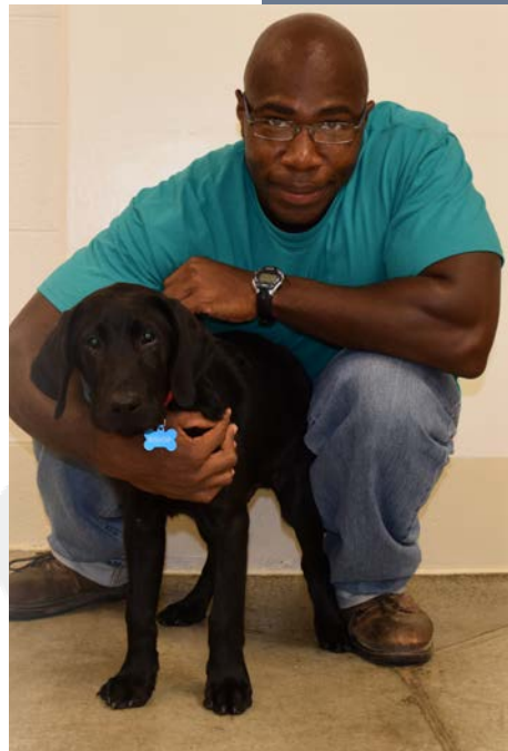
NEED NAME HERE

After completing their time in Bland, the dogs move on to advanced